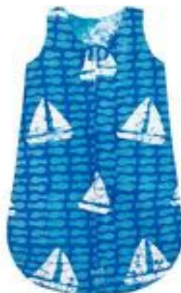
Infant Sleeping Bag