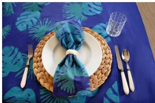
Placemat & Napkin

Fran has organic cotton charming batik dresses and rompers for girls in sizes 2 – 12, and shirts for babies and kids up to size 2, bloomers, rompers, bibs, crawling shoes, and a sleeping bag for an infant, batik bags of all sizes, home décor products including batik aprons, tablecloths, placemats, napkins, table runners, pillow cases, trivets, pot holders, button and Velcro baskets, and bins, a few women's blouses skirts, sarongs, and headbands, jewelry and ornaments crafted from recycled glass beads, and skin care products and soaps made with shea butter from a tree in Ghana. There are some new designs. Come, browse, and pick out a special item for friends, family, or yourself. You will be helping to support women in Ghana to send their children to school at the same time. Ten percent of all proceeds will go to the branch.