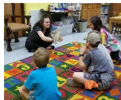
Librarian reads the story to the children