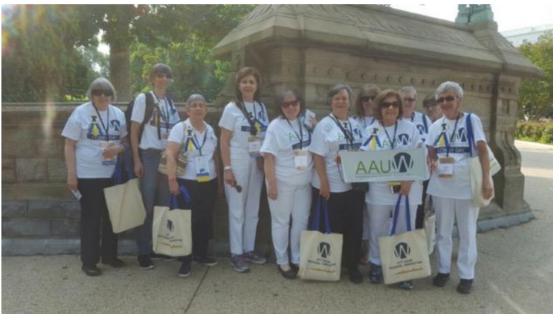
Pennsylvania AAUW attendees at the National Convention, Washington DC