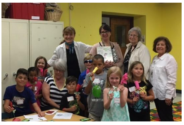
Group photo of Wanda's Roses at Easton library