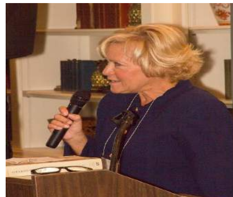
Senator Lisa Boscola