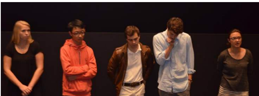
LaFayette student film producers