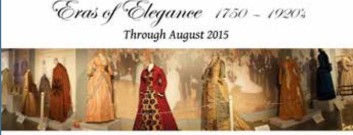
SIGAL Museum of the Northampton County Historical & Genealogical Society 342 Northampton Street Easton PA Sigalmuseum.org