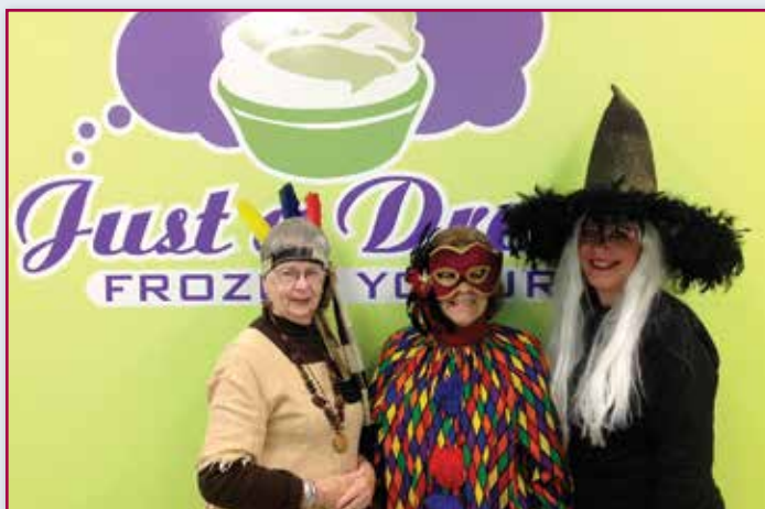
Some members getting into the Halloween spirit at Just A Dream Frozen Yogurt on October 28.